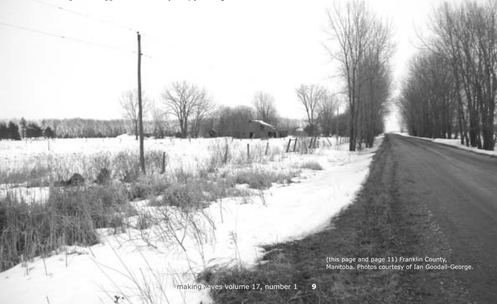
(this page and page 11) Franklin County, Manitoba.

The research project had four steps. Firstly, we sought out statistical data that would tell us whether agriculture in Franklin was experiencing the same trends that were being reported nationally. Secondly, we looked for evidence that the small family