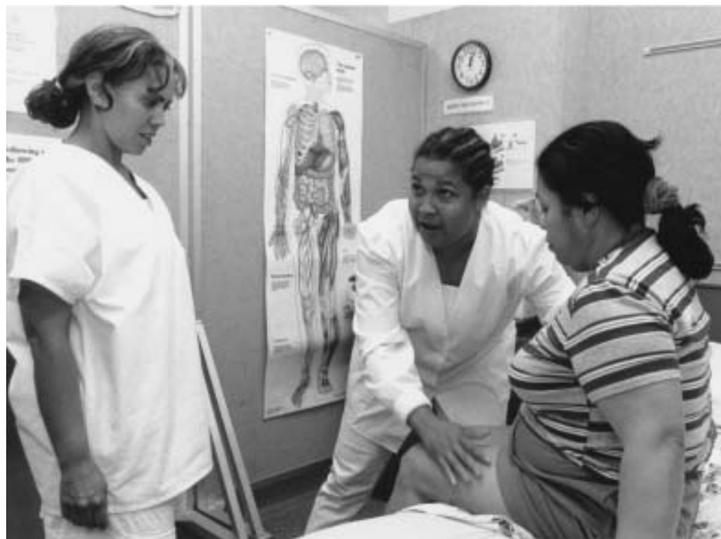
(left) A registered nurse supervises the clinical work of a CHCA home health aide trainee. A recent survey revealed that 56% of CHCA trainees did not work in the year prior to their entry, and 15% had never worked in their lives. Most were single heads of households with children; 42% lacked a high school diploma.

Charitable investors have also been significant supporters of efforts to replicate the CHCA model in other cities in the eastern United States and to experiment with new approaches and programs.