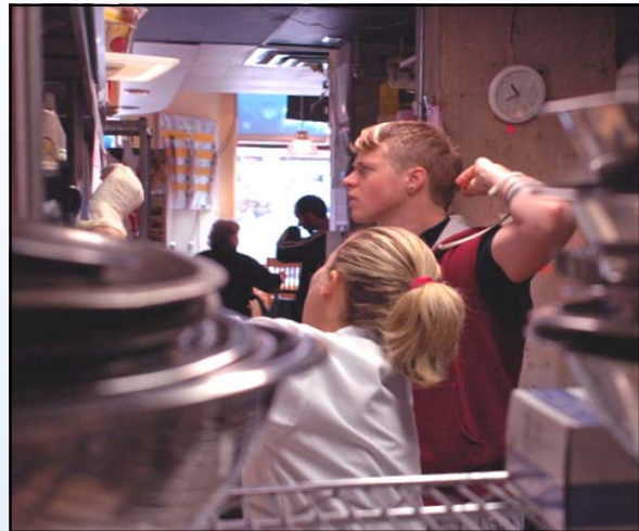
Potluck Cafe and Catering, a Vancouver social enterprise.