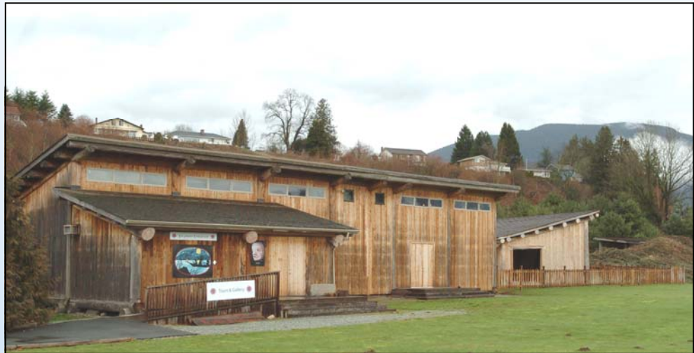
XÁ:YTEM, an archaeological site and museum managed by the Stó:lō First Nation, includes a social enterprise gift shop.

See pages 3-5 for more detail about planned activities.