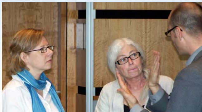
Delegates gather at BALTA's 2009 Symposium in Calgary