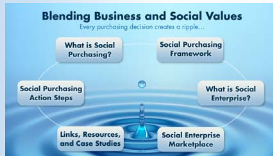
Diagram from Social Enterprise Purchasing Toolkit