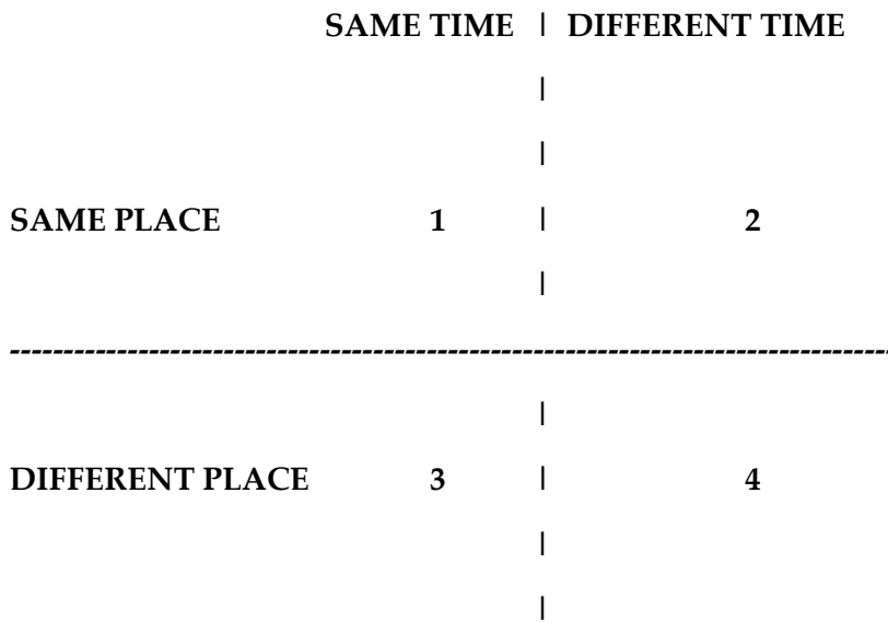
Figure 1: Time and place shifting in distance education.

Figure 1, below, shows how place and time can be rigid or flexible in learning situations.