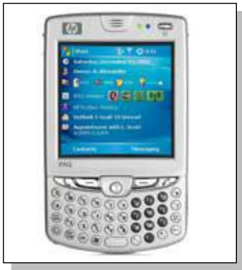
Figure 1. The HP iPAQ 6955

It was not a simple task for our participants to learn to use all the features available on these devices. As reported above, the PDAs provided to the participants were loaded with a relatively wide range of software. The HP iPAQs also provide users with a number of built-in features, including both a touch screen (with stylus) and a thumbing keyboard (See Figure 1) and the capability to transcribe hand writing using the stylus to text. In addition, when appropriate service is available, iPAQ 6955 users can use either WiFi hotspots or GPRS (cell phone and data) wireless connectivity to send email, browse the Internet or use an audio conferencing program such as Pocket MSN Messenger or Skype. Participants were provided with both types of connectivity. For the study, the iPAQs were set up with local service GPRS connectivity and WiFi was available both on campus and in spots around the community (e.g., coffee shops) as well as the home networks of some participants.