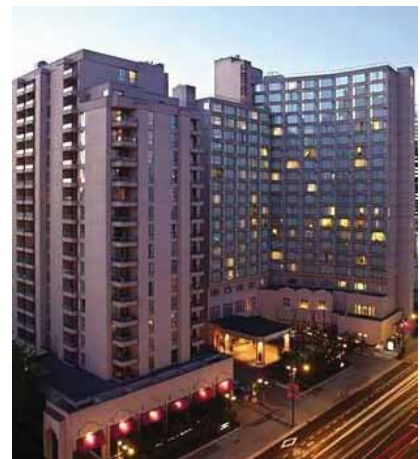
Sutton Place Hotel, 845 Burrard Street, Vancouver, BC