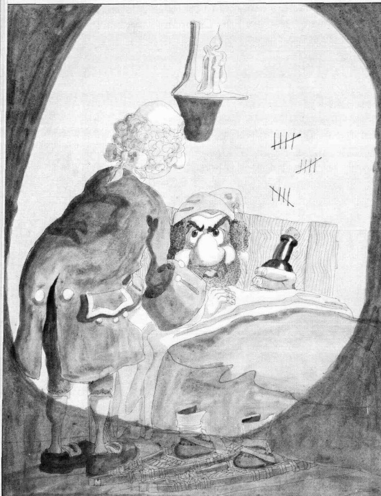
'Every evening at sundown he locked the factory's gates himself, saw every servant to bed at the eight o'clock bell, and checked every change of the watch.'