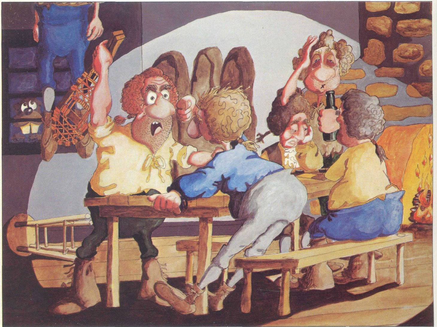
'Tempers grew shorter as the winter lengthened and the new recruits succumbed to the bottle and inevitable melancholia.'