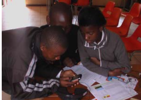
Figure 5. Trying out the MobilED service