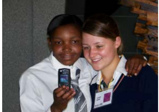
Figure 8. Collaboration and peer-learning.