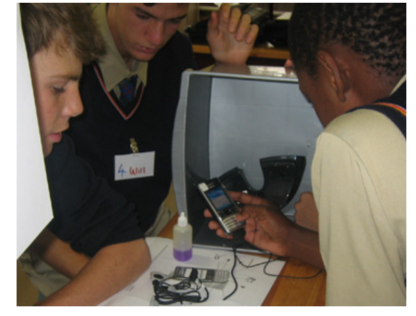
Figure 4: Using the audio wikipedia